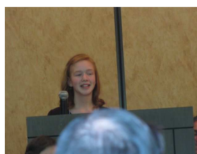
M. Rhonde Oratorical 2 nd Place