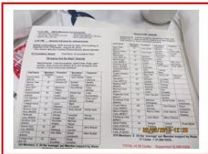
SWIS 2011 – 2012 was a great year thanks to all these optimists and the 'legacy' they left in their local communities.