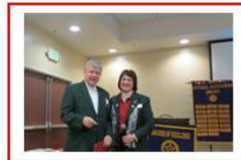
Special Past Gov. Assoc. Award Increasing SWIS Membership from 8/27/2012 – 9/30/2012 by Over 5 members for 11-12 year.